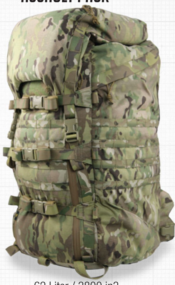
62 Liter / 3800 in3 3 lbs. 12 oz without frameset Front and Top Opening Removable / Adjustable Lid Dual Hydration Pouches