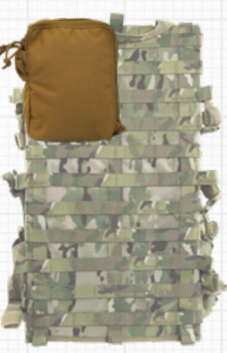
ONE-SIXTH Fraction Pouch ™ 6.5"x 7.5"x 3.5"