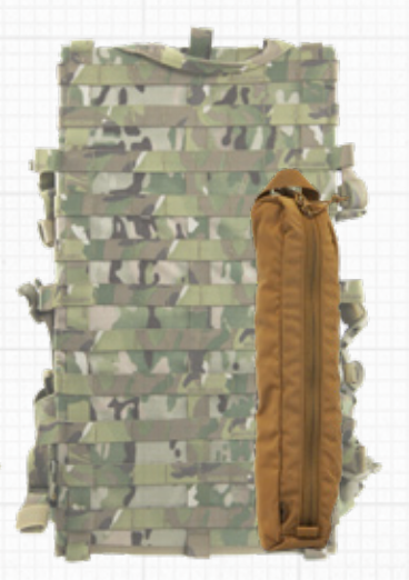
SLIM VERTICAL Fraction Pouch 4"x 18"x 3.5"