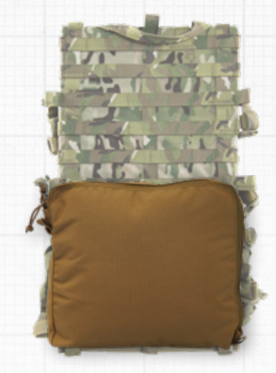
ONE-HALF Fraction Pouch™ 13"x 11.5"x 3.5"

FUTURE LOAD CARRIAGE OPTIONS - FRACTION POUCHES (AVAILABLE 2021)