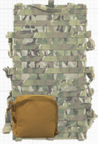
ONE-EIGHTH FRACTION POUCH 6.5"x 6"x 3.5"