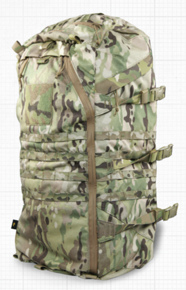
45 Liter / 2800 in3 3 lbs. 3 oz without frameset Front Opening Only Internal Storage and Compression Dual Hydration Pouches