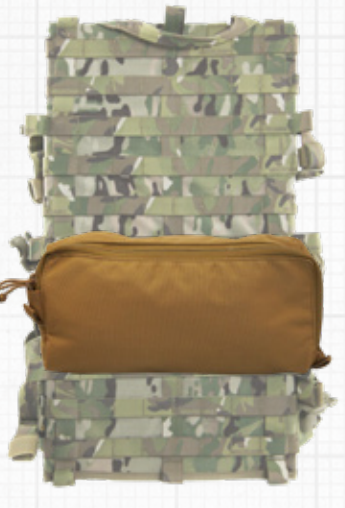
ONE-FOURTH HORIZONTAL Fraction Pouch™ 13"x 6"x 3.5"