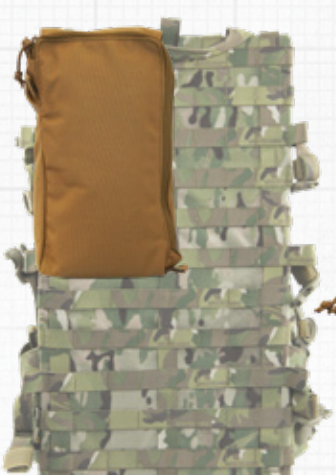
ONE-FOURTH VERTICAL FRACTION POUCH™ 6.5"x 11.5"x 3.5"