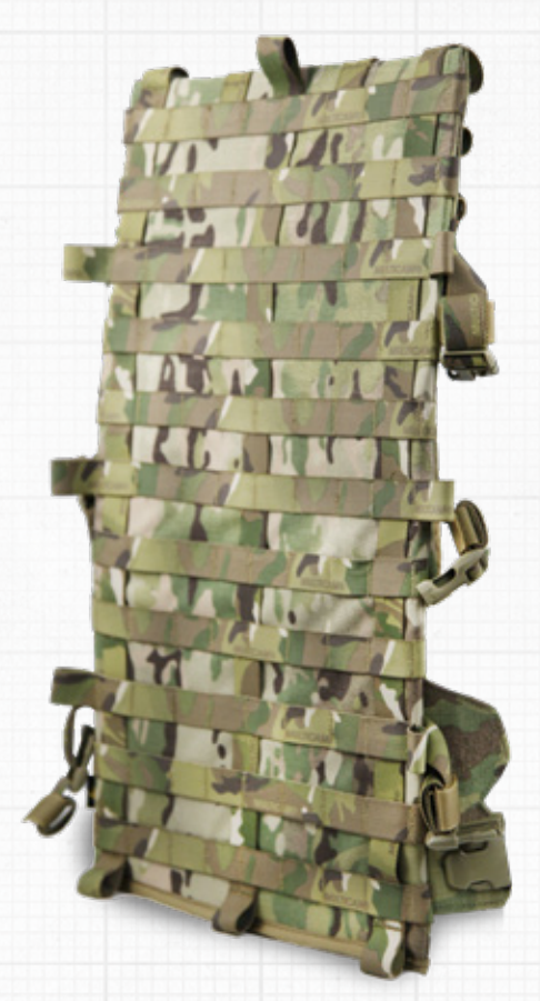
13" x 23" MOLLE Field 2 lbs. 9 oz without frameset Strong internal supports Significant sewing reinforcement Combination of 500D and 1000D