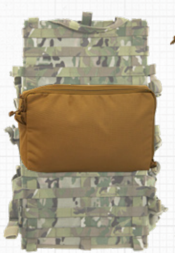
ONE-THIRD Fraction Pouch™ 13"x 7.5"x 3.5"