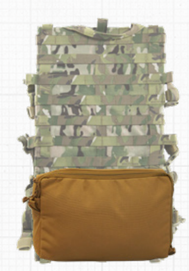
ONE-THIRD HARD TOP FRACTION POUCH™ 13"x 7.5"x 5"

The pouches can be used to divide up the 23"x13" MOLLE Panel into endless combinations of load carriage possibilities. Seen here used with the X-flap (far left) and WR straps (far right) for carrying bulky or elongated items.